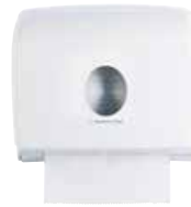
▲ AQUARIUS* Compact Multifold Towel Dispenser