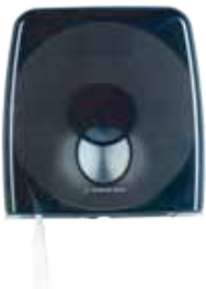
▲ AQUARIUS* Jumbo Roll Dispenser Smoke