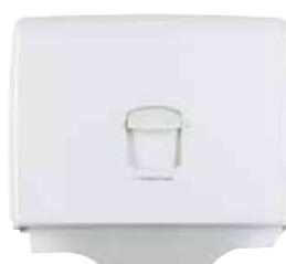
◀ AQUARIUS* Toilet Seat Cover Dispenser