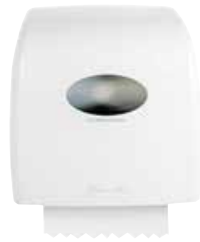
▲ AQUARIUS* Slimroll Hand Towel Dispenser

Our range of 10 fully co-ordinated dispensers help improve the image of your washroom