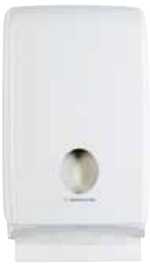
▲ AQUARIUS* Compact Towel Dispenser