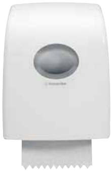
▲ AQUARIUS* Hard Roll Towel Dispenser