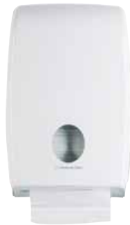
▲ AQUARIUS* Multifold Towel Dispenser