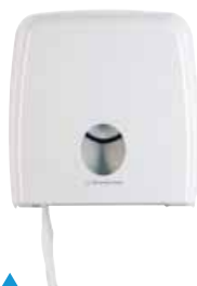
▲ AQUARIUS* Jumbo Roll Dispenser